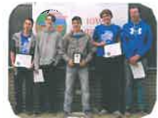
Current Issue Winner Bellevue FFA White