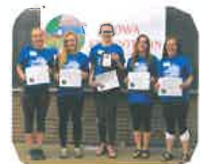
Oral Presentation Winner Decorah Painted Turtles