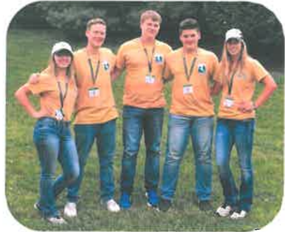
2017 Iowa Envirothon Champions Southwest Valley FFA in Emmitsburg, Maryland

The 2017 Iowa Envirothon took place on Monday, April 24 at Springbrook State Park near Guthrie Center, Iowa. It was a great day filled with fun and excitement as the teams were ready to test their knowledge on the environment. The day would not have been possible without the help and support of our sponsors and volunteers. We greatly appreciate their time and contributions to make the Iowa Envirothon such a wonderful event for our future leaders!