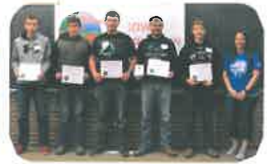
Runner Up Maquoketa FFA 1