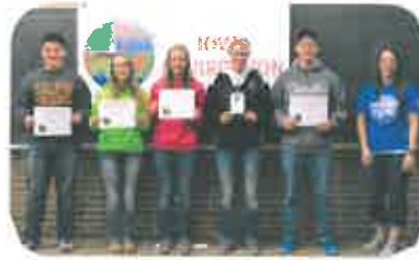
Overall Top Score, Forestry, Soils and Wildlife Winner Southwest Valley FFA

Overall Top Score..... Southwest Valley FFA Runner Up..... Maquoketa FFA 1 Aquatics..... Marshalltown High School Current Issue..... Bellevue FFA White Forestry..... Southwest Valley FFA & La Porte - Dysart FFA (tie) Soils..... Southwest Valley FFA Wildlife..... Southwest Valley FFA Oral Presentation..... Decorah Painted Turtles