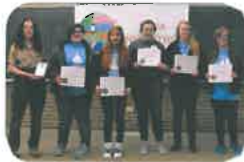
Aquatics Winner Marshalltown High School

Bellevue FFA White Cardinal FFA 1 Decorah MHEMO Decorah Painted Turtles La Porte - Dysart FFA Louisa - Muscatine FFA Maquoketa FFA 1 Marshalltown High School Muscatine FFA Blue Muscatine FFA Gold North Scott FFA Southwest Valley FFA Unity Christian FFA 1 Unity Christian FFA 2 Winterset Huskies