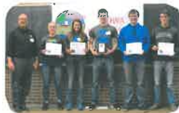
Forestry Winner La Porte - Dysart FFA